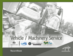
Selection of record keeping books