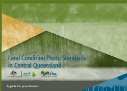
Land Condition Photo Standards in Central Queensland

Along with the Rules of Thumb, FBA has a range of resources to help land managers make improved management decisions. Contact FBA to learn more or access these resources.