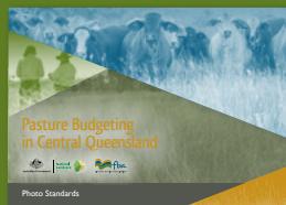
Pasture Budgeting in Central Queensland: Photo Standards