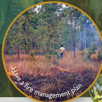
Have a fire management plan