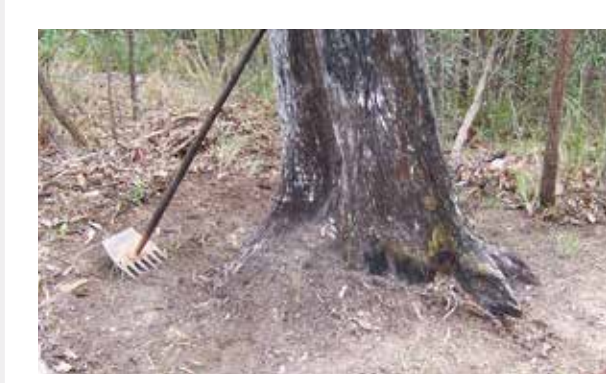
Fire rakes, such as this McLeod Tool, can be used to rake away leaf litter from the base of habitat trees.

This track mounted remote-controlled flail mower can be used to create temporary fire management (control) lines. It can work on very steep slopes and being only 1.2 metres wide it can weave in between most trees. It provides a softer alternative to conventional machinery that scrapes the ground, leaving bare earth. These flail mowers are therefore especially useful to create control lines on steep slopes and erosion prone soils.